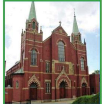
Saint Mary of Czestochowa 857 Kenneth Avenue New Kensington, PA 15068

Daily Mass: (Monday - Wednesday, Friday) 12:30 p.m.