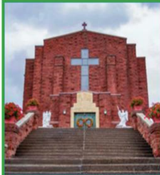
Mount Saint Peter 100 Freeport Road New Kensington, PA 15068

Daily Mass: (Monday - Thursday) 7:30 a.m.