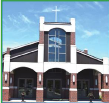
Saint Margaret Mary 3055 Leechburg Road Lower Burrell, PA 15068

Saturday ~ 4:00 p.m. Sunday ~ 8:30 & 11:00 a.m.